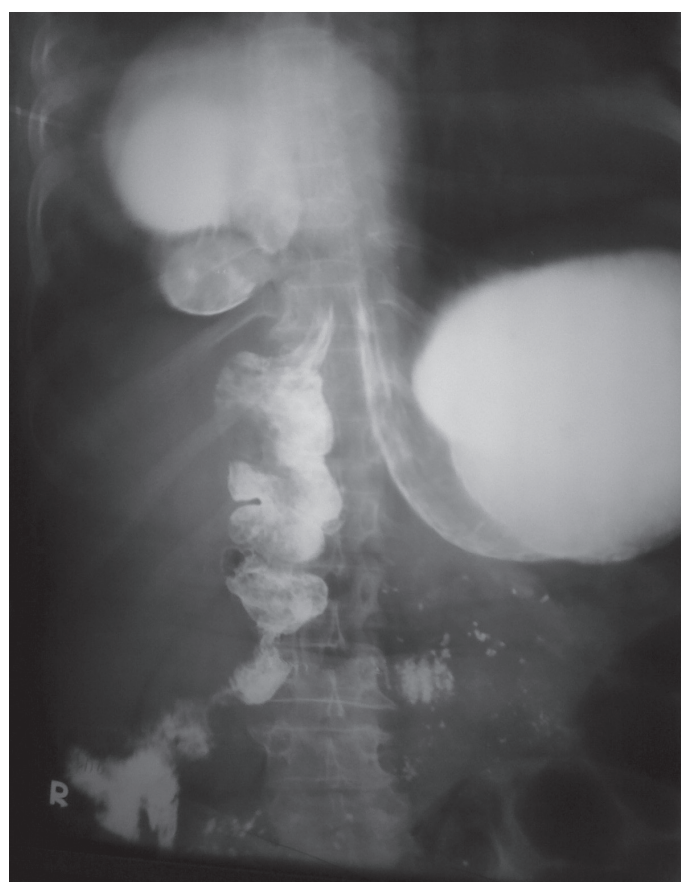
[Table/Fig-1]: Barium meal study showing an mesentrico axial type of gastric volvulus due to stomach herniation in to right hemi thorax

which was associated with minimal adhesions was present. (Table/ Fig-2).The contents were reduced by using gentle traction and the defect was closed with suture material prolene 2.0 in two layers. The gastro-colic ligament was freed. A right ICD tube was inserted. The post operative period was uneventful. The patient was asymptomatic on 6 months of follow up.